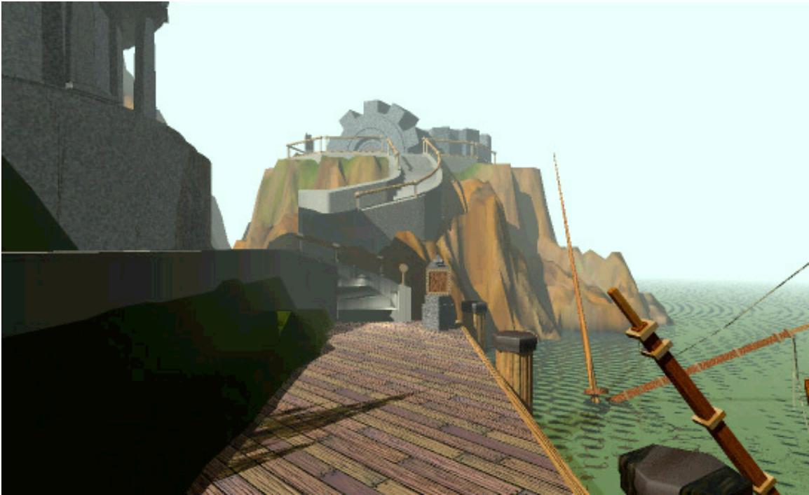
Screen shot from start of Myst taken from Cyan WWW site at www.cyan.com