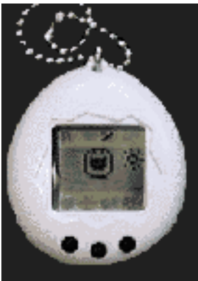
Picture of Tamagotchi

As a last note about the history and typology of computer games, I would draw your attention to the release of the Tamagotchi in Japan in 1996 and in North America in 1997 by the Japanese toy company Bandai . This computer game doesn't fit into either the action/arcade or adventure categories of game. Its pace is different and it is portable. 6 It has spawned a further type of game that we can call digital pets.